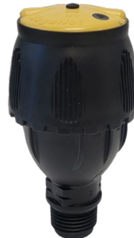
1/2" MPT Base

Operating Pressure 25-45 PSI 42' to 55' Diameter (Smallest to Largest Nozzle) 24° Trajectory