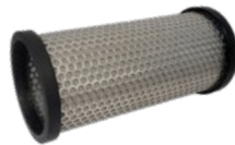
1½" & 2" Spin Clean Screen

150 Mesh.....Black..... For Drip 50 Mesh..... Yellow..... For Sprinklers 30 Mesh..... Orange..... For Sprinklers